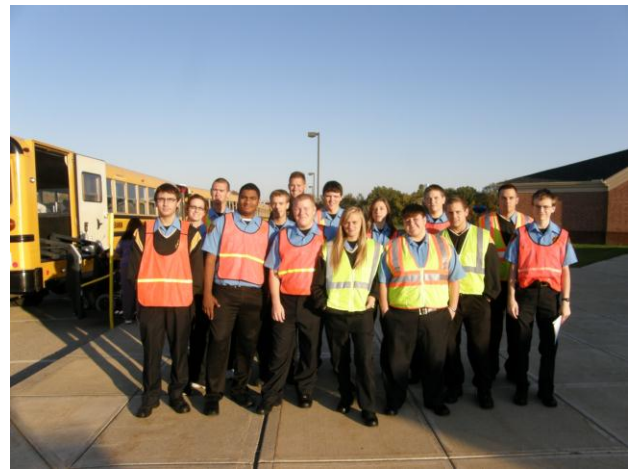
WCCC Criminal Justice seniors are ready to assist at the Bowman Primary Vehicle Day

WCCC's Criminal Justice program, through the coordination of the Career Development Office, was able to perform parking duty and be ambassadors to the business and industry partners that helped Bowman Primary School in Lebanon with their recent Vehicle Day. One of the more interesting tasks was to help inflate a hot air balloon that was on display for the children to observe.